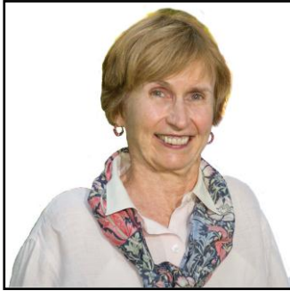
MEMBERS OF THE BRANCH