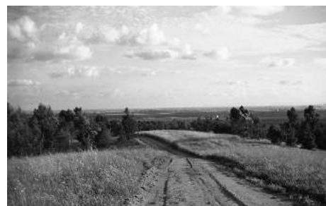
MURPHY'S RANCH, 1941