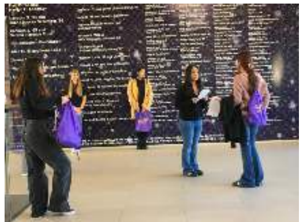
They carried their AAUW backpacks and had a moment to check out the donor wall.