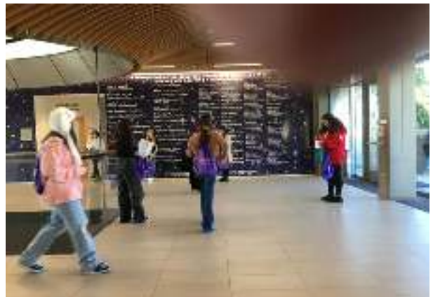
Many walked from the Shannon Center to the Science Building.