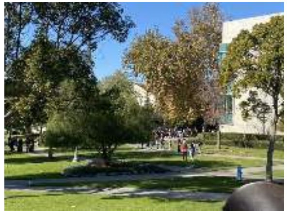
It was a beautiful sunny day at Whittier College, you can see the girls going to their classes.