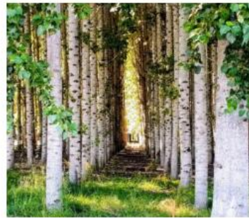
Monique Farland – “Light Through the Trees”