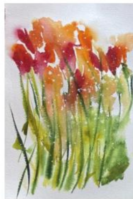
Nelda Reid – “Summer Blooms”