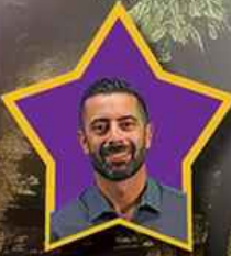
TONY CARRASCO Anaconda Street Productions