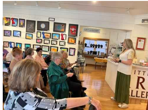
April meeting at the Whittier Art Gallery

Location: Fellowship Hall First Friends Church Whittier 13205 Philadelphia St. Whittier, Ca. 90601