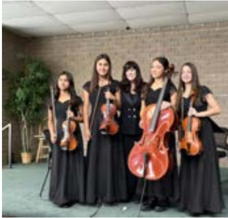
The East Whittier Middle School String Quartet was amazing.